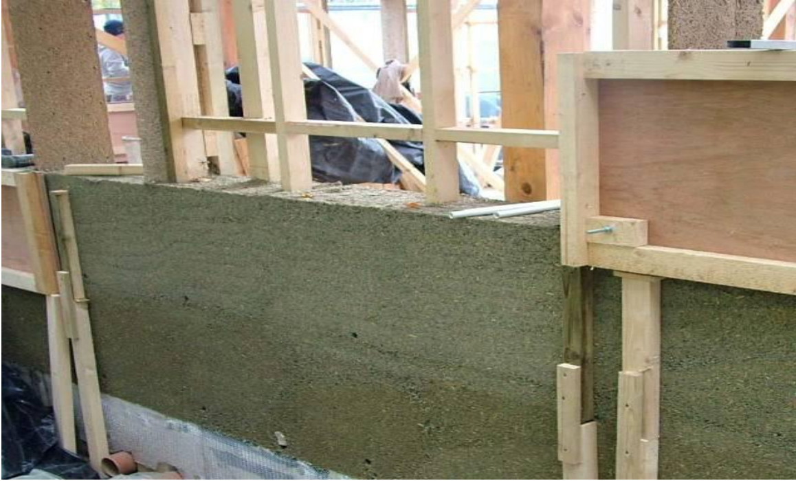
Hemp Lime wall infill in timber frame after striking of shuttering: Photo BESRaC