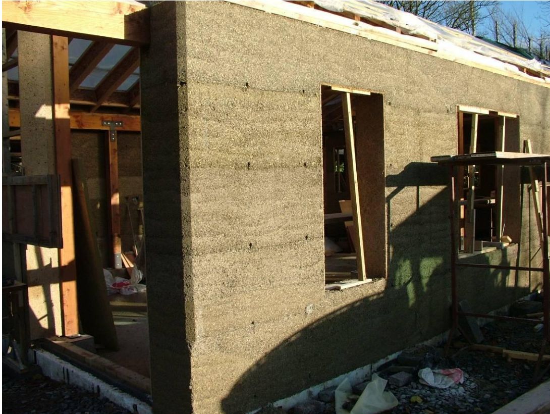
Hemp Lime wall at cottage by Tom Woolley

The development of a specific code / standard with detailing and construction / application guidance is important for the correct application of the material in construction.