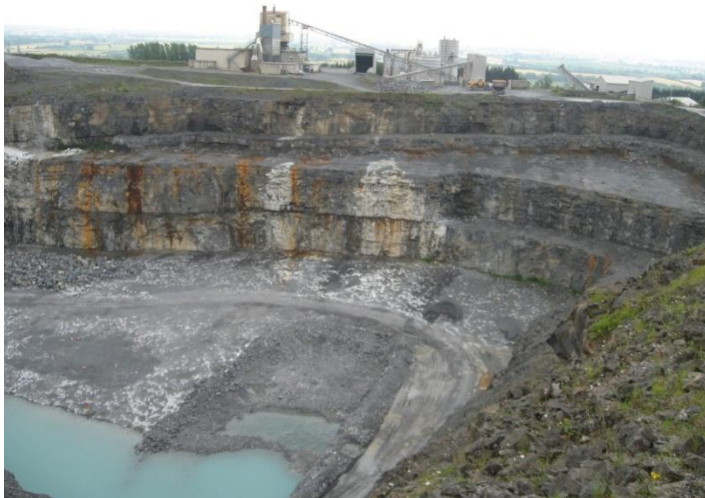
Lime quarry and production plant Clogrennane, Ireland.