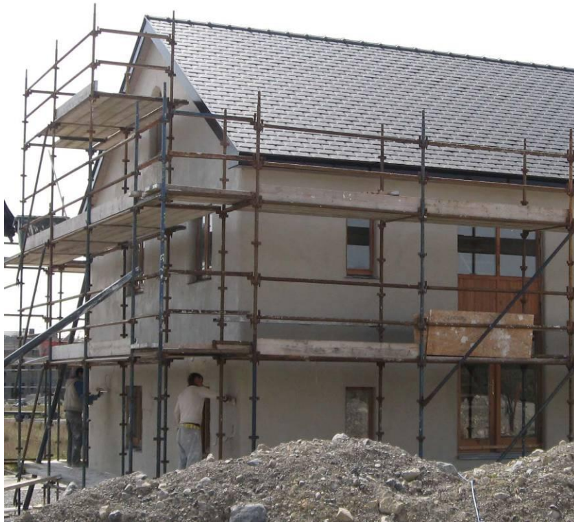
Hemp Walled House being rendered, Cloughjordan, Co Tipperary: Photo BESRaC.

Thermal mass properties of hemp lime may not be fully reflected in the DEAP methodology and importantly U value and steady state heat loss assessments do not reflect dynamic thermal mass behaviour and advantages. The studies collated indicated significant thermal impacts as a result of the materials thermal mass properties.