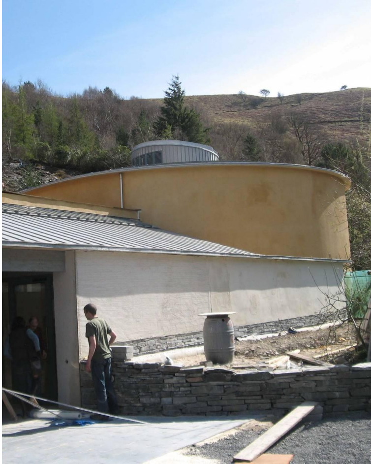
Hemp Lime Walls at the CAT Wise building in Wales.