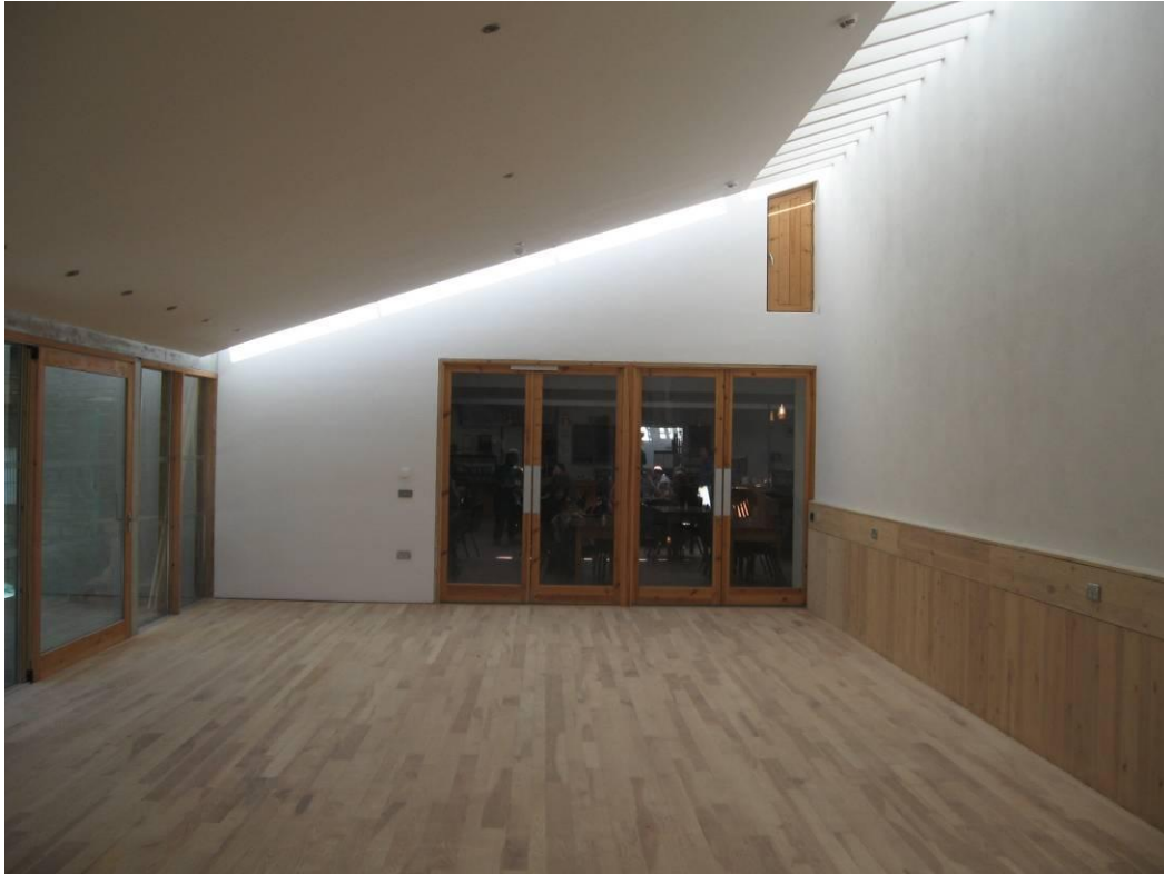
Internal Photo of CAT Wise building in Wales.

Water spray tests on rendered hemp lime 200mm thick wall samples show that water gets absorbed only in the 50-70mm exterior layer after having gone through severe exposure to wind driven rain over a 96 hours period.(BRE, 2002).