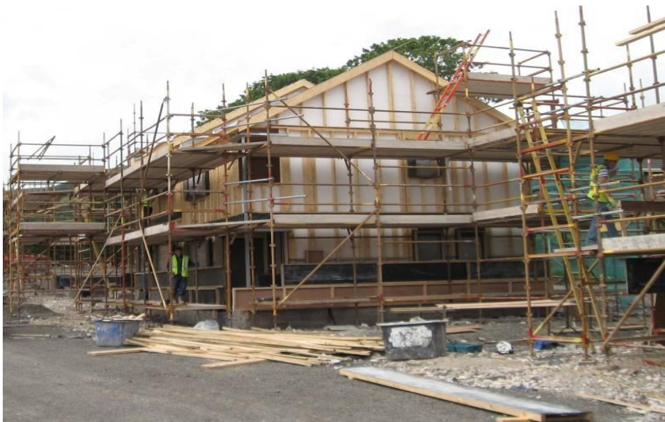
Hemp Lime infill to timber frame semi detached housing units at Carnlough, Co. Antrim, Northern Ireland. Early shuttering above and later pre rendering stage below.