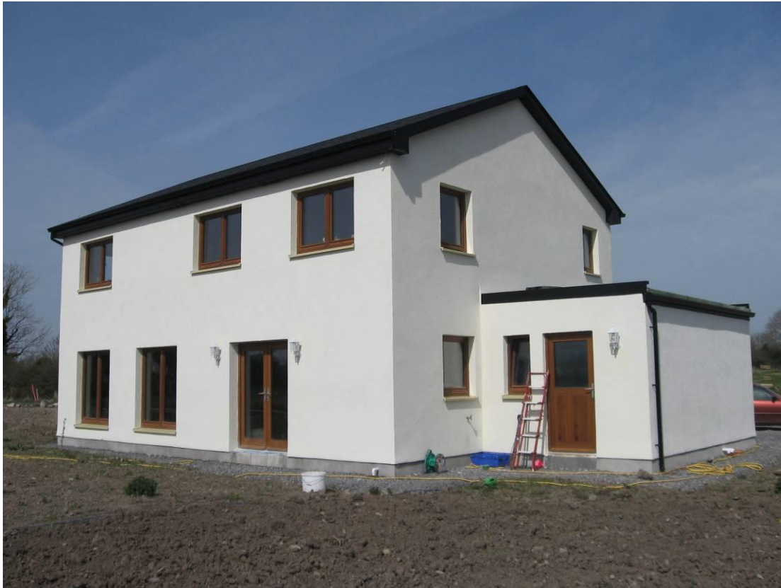
Hemp Lime walls with lime render at 'The Village' Cloughjordan, Co Tipperary.

Further research and testing is required to examine the material in applications requiring higher strengths and loads and for load bearing cast in situ and precast construction, but based on the indicative data collated, actual solutions may be achievable with strength additives and appropriate design and detailing.