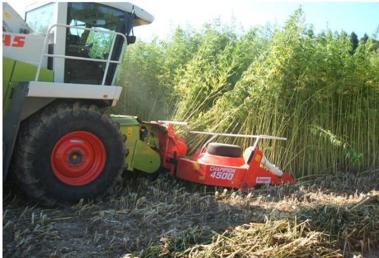
Hemp being harvested.

processing/production facility which would require a capital investment of €4-5 million and a crop area of 1000 hectares. It would employ about thirty staff and could be replicated regionally to generate up to 300 full-time jobs (Caslin, 2009). Product testing and certification to secure market access will require further investment .. Such high initial investments costs create a barrier to start-ups.