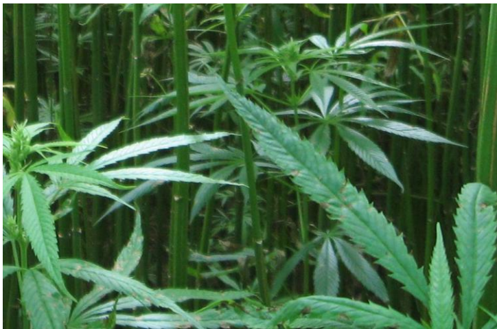
Hemp plant growing at TEAGASC Research Centre, Ireland.

More recently between 1997 and 1999, Teagasc looked at hemp as a crop for medium density fibreboard production. The aim was to establish the yield potential of the crop. Different varieties, sowing dates and seeding rates were tested. It was concluded that hemp can produce high yields of stem material, however harvesting and storage techniques had to be developed (Crowley, 2001). The most recent research project took place in 2008 with the aim of assessing hemp as an annual energy crop with experiments aimed at optimising the fertilisation rates (Finnan, 2010 pers. comm.).