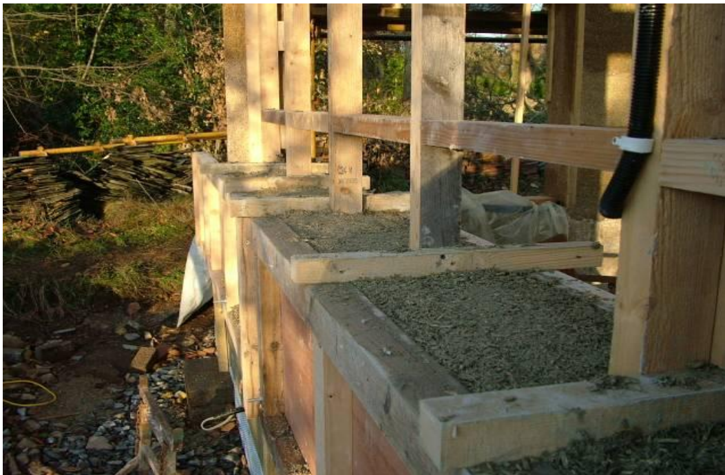
Hemp Lime wall infill in timber frame / shuttering: Photo Tom Woolley

To prove equivalence the use of hemp in a separating wall would need to be tested as part of a certified system.