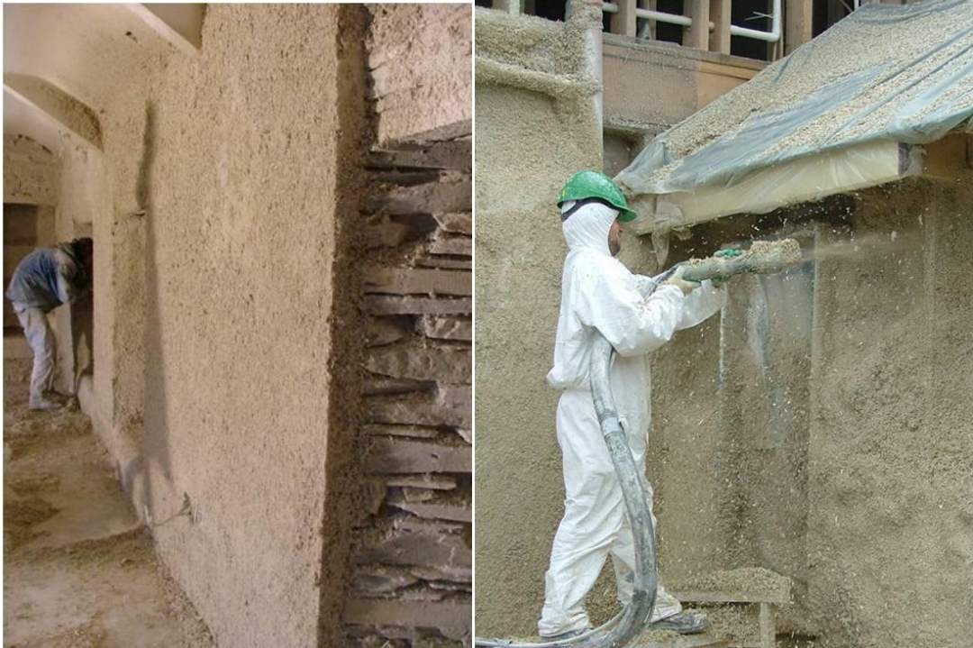
LHS Internal Hemp Lime application to an old stone wall Photo Steve Allin RHS External Hemp Lime spray application to inner shuttered timber frame wall Photo Steve Allin